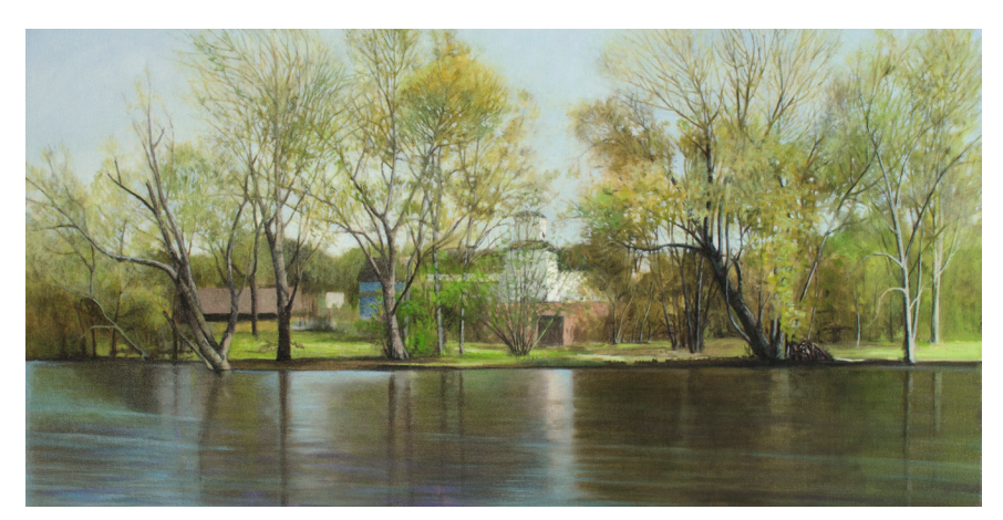
Oswego Grain Elevator on the Fox, April 17, 2017