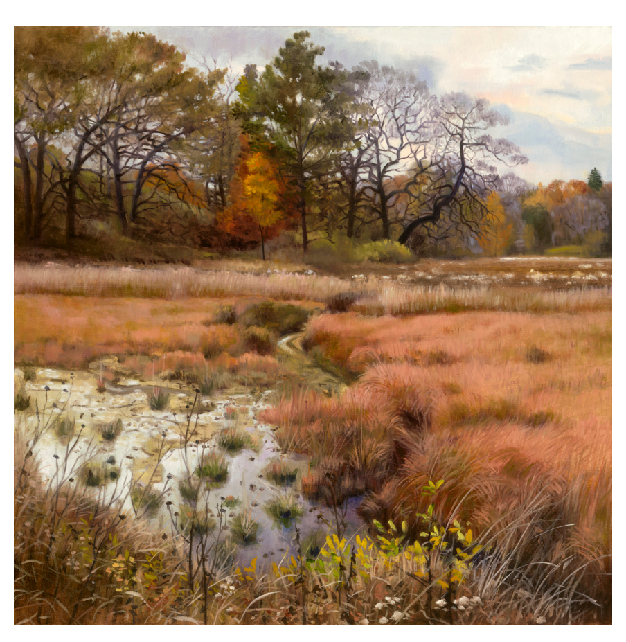
Bluff Spring Fen, Oct. 31, 2016