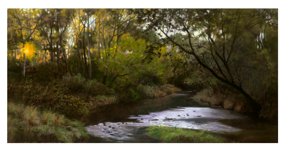
Ferson Creek Sunrise, Oct. 13, 2016