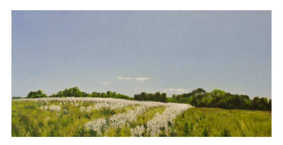
Fox Glove in Bloom Dayton Bluffs, June 6, 2017