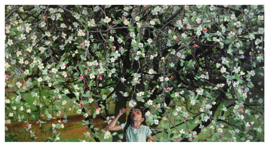
Holy, Holy, Holy, 2006