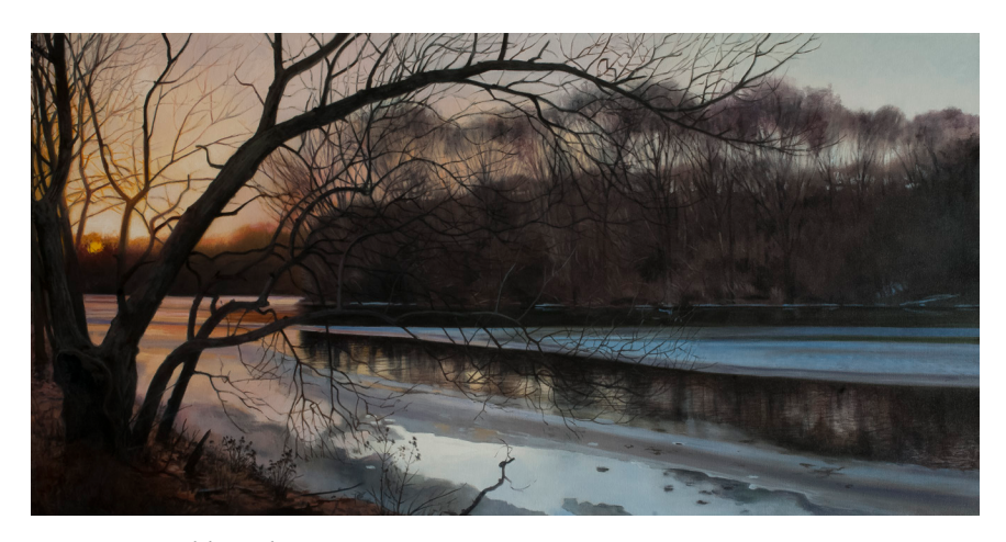
Jan. 2 Lippold Park Sunset, 2017