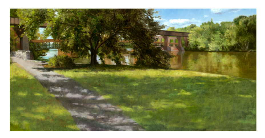
Fox River, Island Park Geneva, Sept. 2, 2016