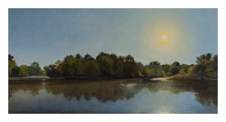
Fox River at South End Park, West Dundee, September, 2016