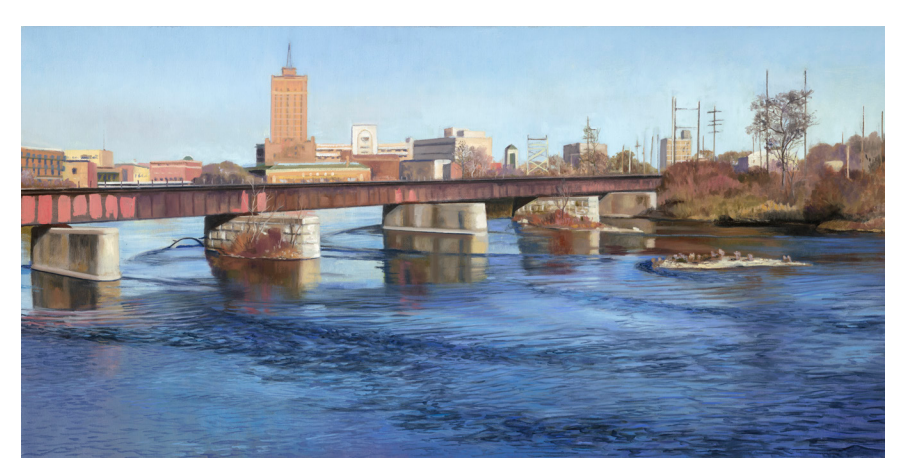
North Ave. Bridge, Aurora Nov. 29, 2016