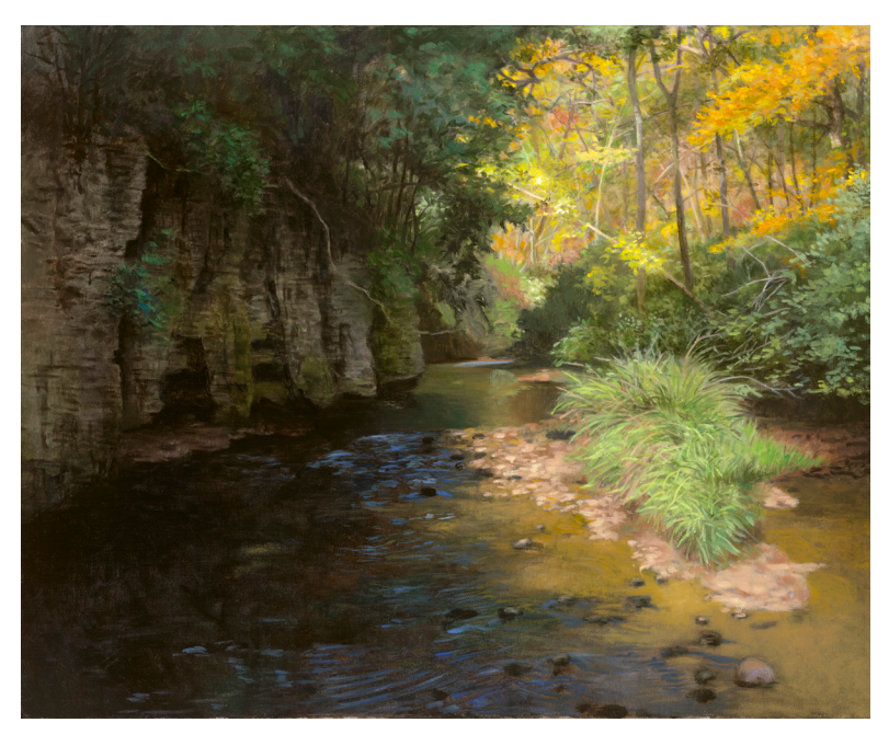
Dolomitic Outcropping Mill Creek, Oct. 24, 2016