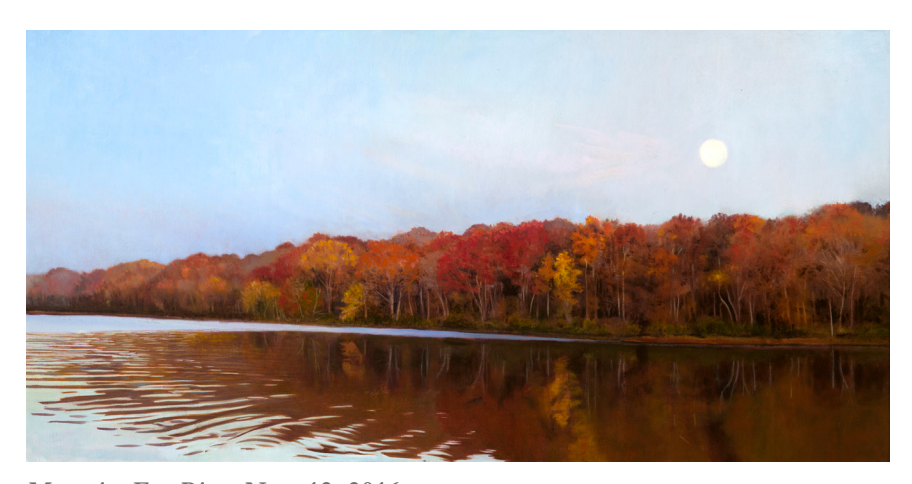
Moonrise Fox River, Nov. 12, 2016