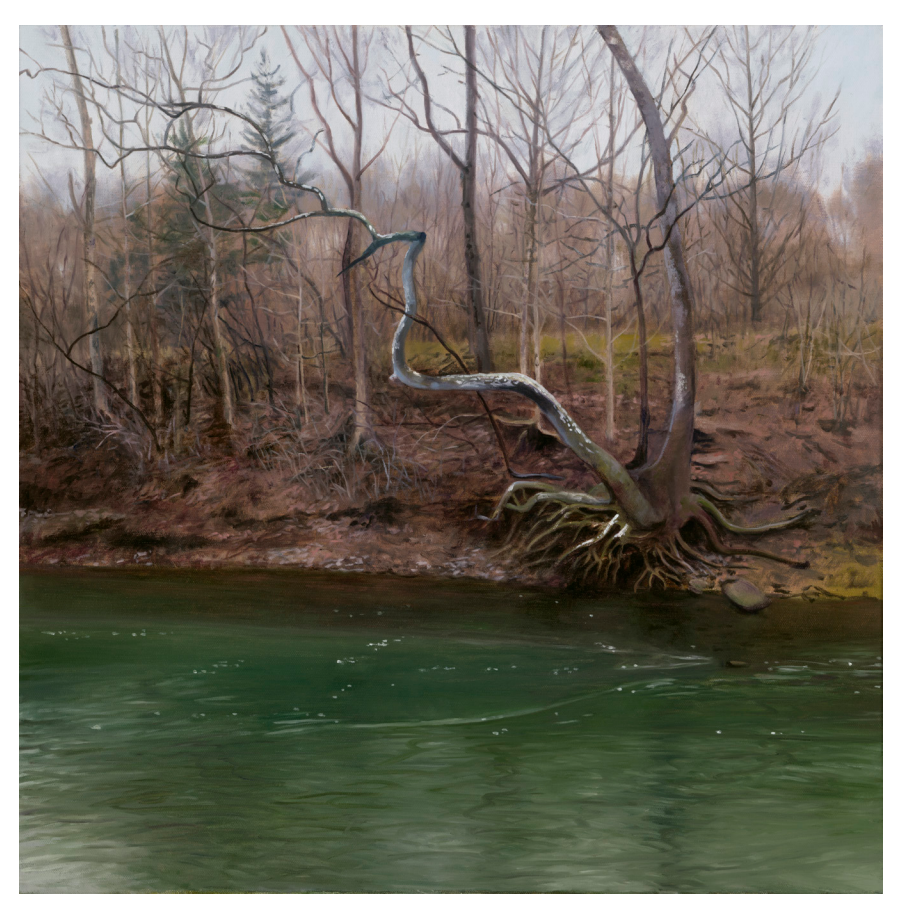
Sycamore on Big Rock Creek, 2017